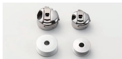
Bobbin for double-capacity hook Bobbin for standard hook

The adoption of the horizontal-axis double-capacity hook helps reduce the frequency of bobbin thread replacement, thereby promising sewing work with efficiency. This hook is also helpful not only when sewing with thick thread but also when sewing a long seam length.